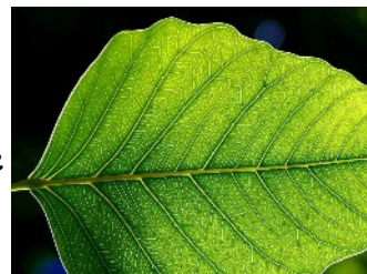
Side veins one at a time off the main vein