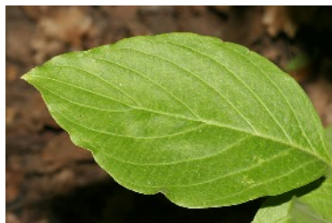
Pairs of veins off the main vein